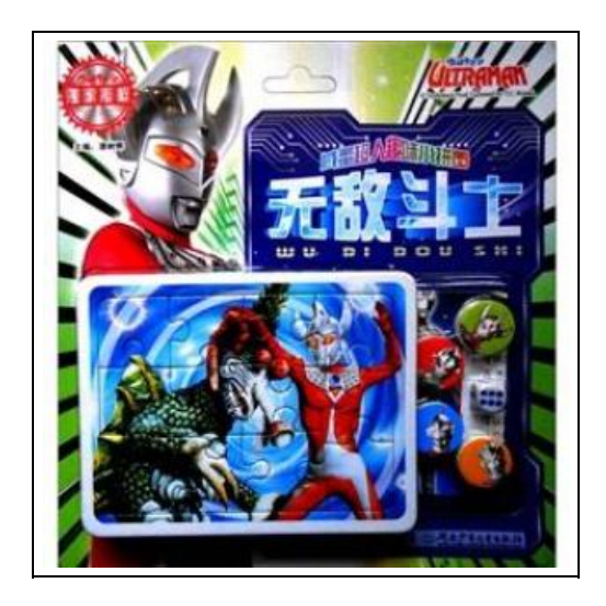
Filesize: 3.89 MB